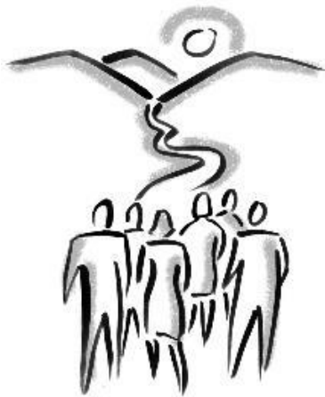
The Road to Emmaus