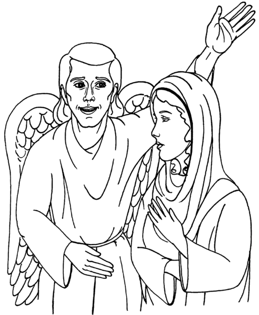
The Angel Gabriel Appears to Mary Luke 1:26-38