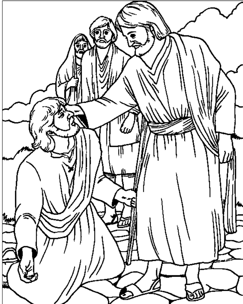
Jesus Heals a Blind Man Mark 10:46-51

From BibleStoryCard Learning System™ Coloring Book © 1996 Wesleyan Publishing House http://www.parable.com/wph/group_1052.htm