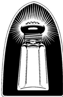
CALLED TO BE SALT

Copyright © Sermons4Kids, Inc. May be reproduced for Ministry Use