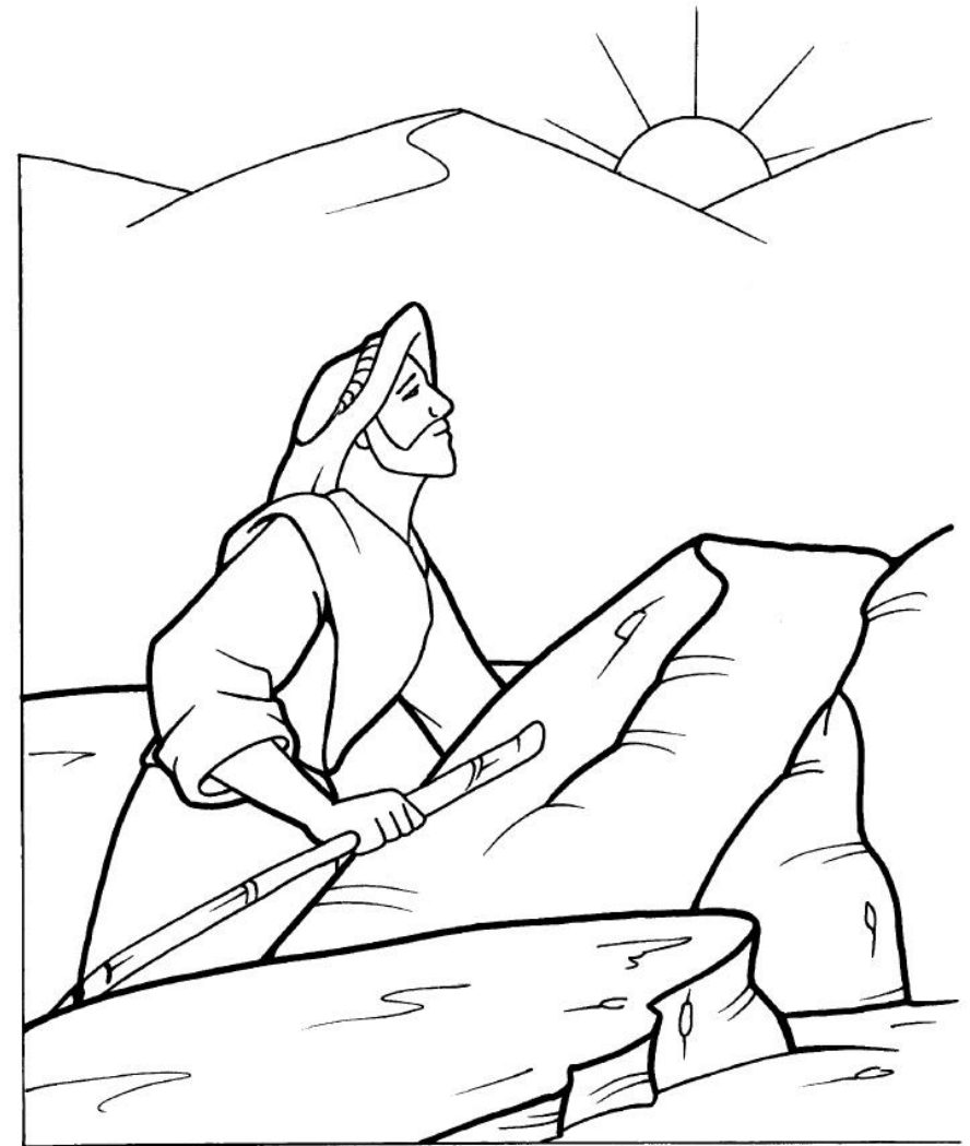
The Temptation of Jesus