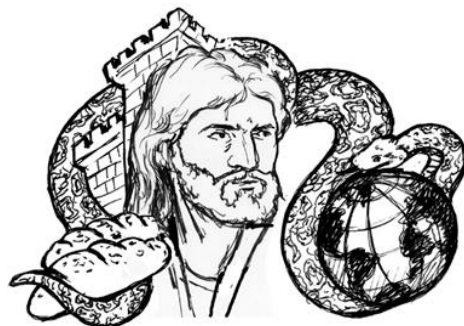
The Temptation of Jesus