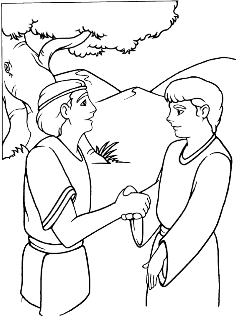
Esau Sells His Birthright to Jacob Genesis 25:19-34

Each number represents a letter of the alphabet. Substitute correct letter for the numbers to reveal the coded words.